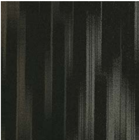
24" X 24" MODULAR TILE

Get commercial design conversations moving with the quickstep movement of geometric design found in Pep Talk. Delivering performance that lasts long after the initial speeches are over.