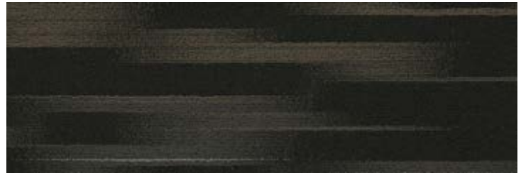
12" X 36" PLANK