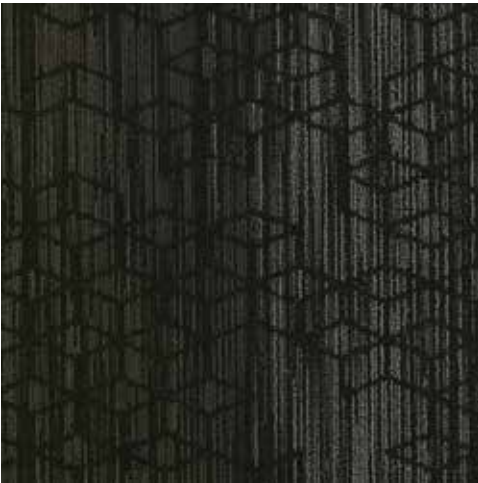
24" X 24" MODULAR TILE

Communicate in the native language of current commercial design with the geometric pattern play of Lingo. It speaks of style that performs under pressure.