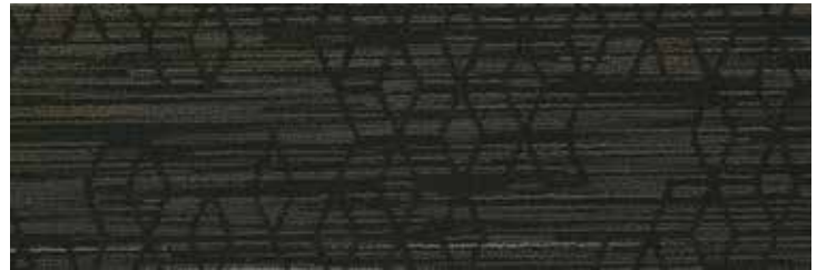
12" X 36" PLANK